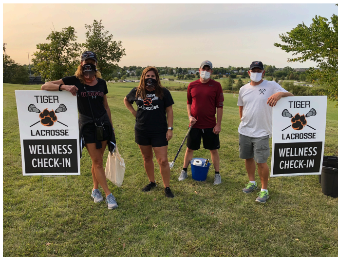
West Des Moines officials welcome players to fall ball check-in with a return to play protocol.

Response to the pandemic — With the help of USA Lacrosse (USAL) and the West Des Moines Lacrosse Club, the Association developed a COVID19 response protocol for member clubs to use for future lacrosse activities going forward. From the large volume of USAL return to play guidance and recommendations, ILAX worked with West Des Moines to create a COVID19 Action Plan (CAP) template that incorporated the most important recommendations for clubs to use as they wrestled with the situation. West Des Moines' input helped ILAX find that balance between what was reasonably safe but yet practical.